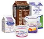
Aseptic Cartons Milk Cartons, Frozen Dessert Boxes