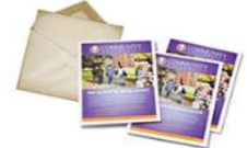
Envelopes, Junk Mail Inserts & Flyers

Please remember to flatten all boxboard boxes