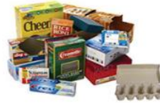
Boxboard Boxes & Moulded Boxboard