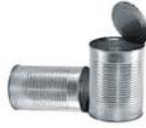
Steel Containers Metal Cans & Lids